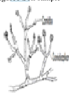
Figure 9 Trichoderma