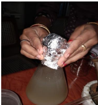
Figure 4 Packing of PDF