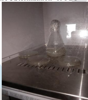
Figure 8 Mother Culture