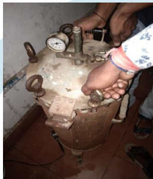
Figure 5 Sterilization of PDF