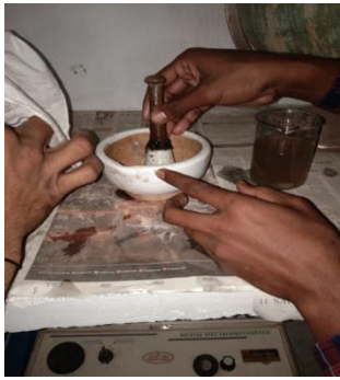
Figure 1 Smashing Potato