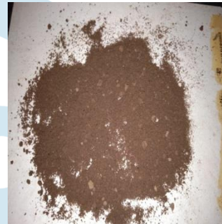
Figure 6 Soil sample