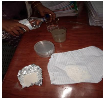
Figure 2 Composition PDF