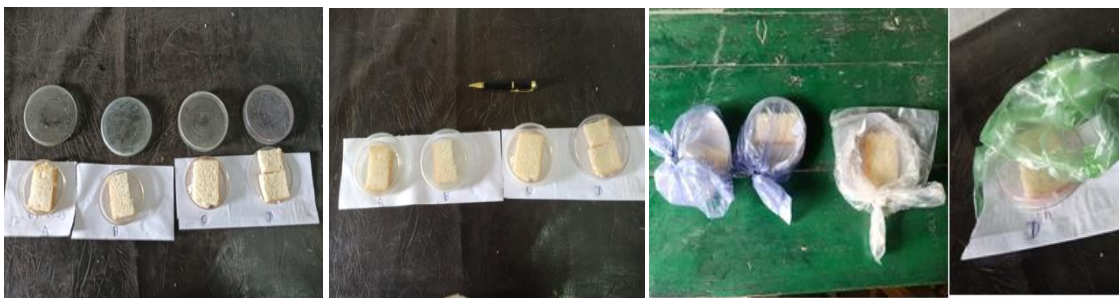
Figure1 Bread in Petri dishes Figure2 +H2O & covered Figure3 Safety Packing in 4 Polythene