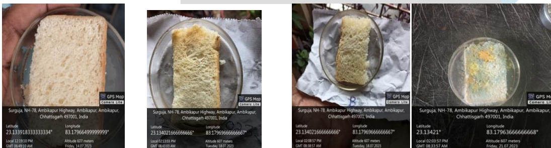
Figure4 2 Day after, Figure5, after 6days Figure6 fresh in fridge on 6 th day Figure7 9 th day